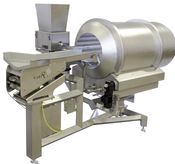
Rosenqvists Seasoning System "Seabase"

If you want support to build an even flow of product or increase your drum performance, Rosenqvists Food Technologies can give you the help you need. We can assist you with running Catch tests, installing weight sensors for increased accuracy of applied seasoning and programming logic to reach your desired level of performance.